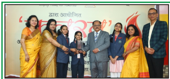
KALRAV: Inter-school Competition